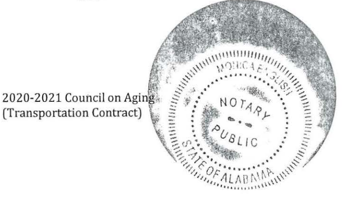
My Commission Expires: May 5, 2024